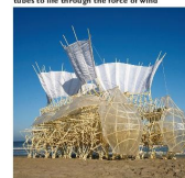
Stranbeest by Theo Jansen brings plastic tubes to life through the force of wind

LAST TIP Half the richness of experiencing the George Town Festival is traipsing the kaki lima , getting lost, and discovering the cornucopia of creative charm for yourself. Hidden installations, mysterious cafés, pop up ateliers, and vintage retailers are just waiting to reveal themselves. One just needs to go forth and explore. ■ From July 29 to August 28 at Dewan Sri Pinang, MBPP Town Hall, Esplanade, and around George Town. www.georgetownfestival.com