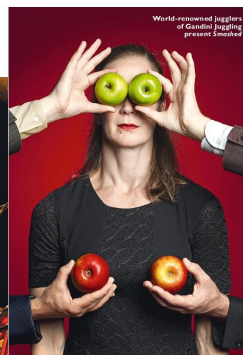
World-renowned jugglers of Gandini juggles greens. Smiling